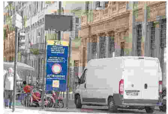
Questa mattina l'accesso alla Ztl centrale sarà libero

dipendenti Gtt durerà tutta la giornata, ma il servizio sarà garantito nelle seguenti fasce orarie: servizio urbano, suburbano e metropolitana dalle 6 alle 9 e dalle ore 12 alle 15; autolinee extraurbane da inizio servizio alle 8 e dalle 14,30 alle