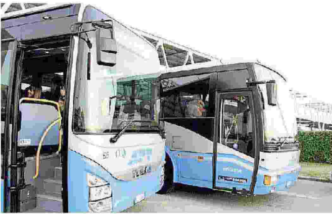
Alcune corriere del servizio extraurbano di Apt